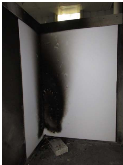
After Test (EN 13823)