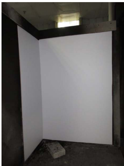
Before Test (EN 13823)